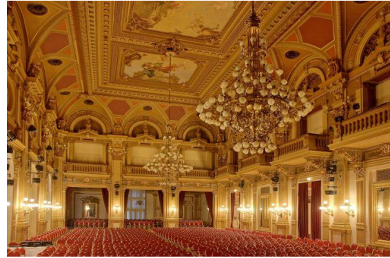
Photos and text adapted from: http://www.nardum.cz/en/halls/national-house-of-vinohrady/